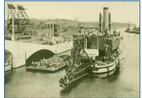
Ellicott 20" Dredge at work in Panama Canal Lock in 1913