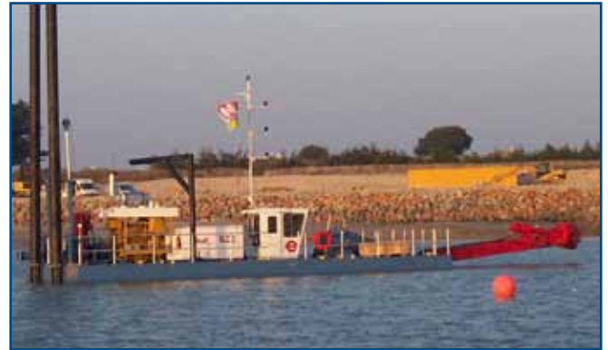
670-33 ft. (10 m) dredging small port