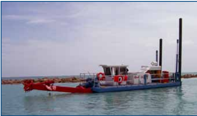
370-20 (6 m) dredging a marina