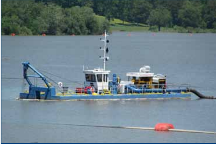
870JD 60 ft. (18 m) used for sand mining