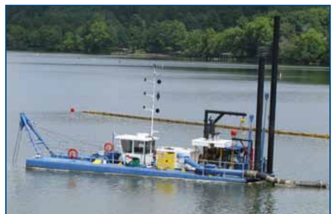
670-42 ft. (12.8 m) dredging a river