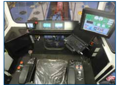
Dredge Operator Control Systems

B y 1907 the U.S. Corps of Engineers took notice and purchased four dredges for the largest construction project ever undertaken—the Panama Canal. The successful performance of these machines led to “Ellicott” becoming a name known all over the world for strong, capable, and versatile dredges.