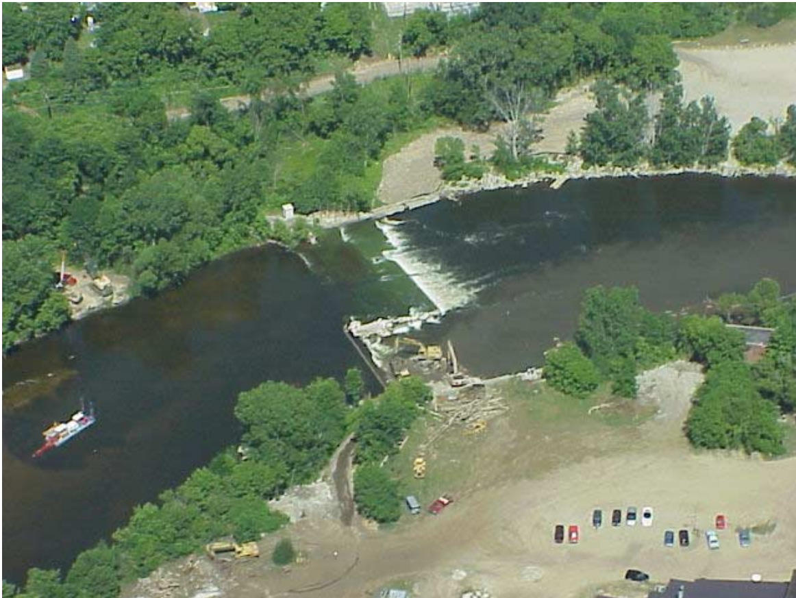
Aerial photo of remnant removal area with diverting structure and MudCat™ in place, June 29, 2000 (46).