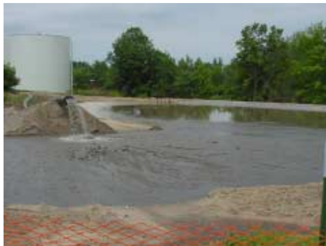
Sediment collection basin. Photo taken facing northeast, July 6, 2000 (46).