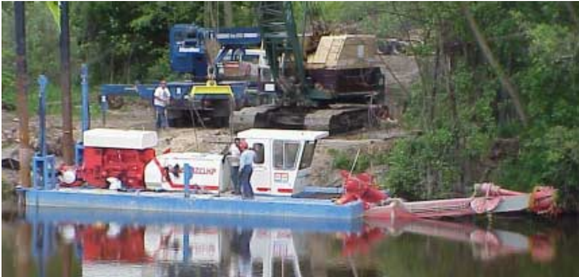
Ellicott Intl. MudCat™ Dredge, Photo taken facing east, June 28,2000 (46).

The sediment is then pumped through a 12-inch diameter pipe approximately 1,200 ft. downstream to the collection site. From this point, the dredged material is discharged to a collection basin where sediment is allowed to settle and water is drained back into the river. Bails of straw have been placed on the bank of the river to filter the water runoff prior to its return. The collected sediment will then be removed at the completion of the construction phase. If possible, the City would like to treat the sediment as a resource and sell it for road fill, etc. (Figure 4).